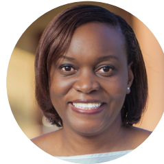
Izukanji Sikazwe Centre for Infectious Disease Research, Zambia