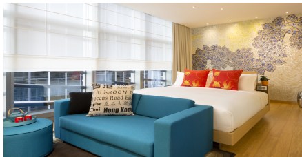
Standard King (320 sq ft / 32 sq m)