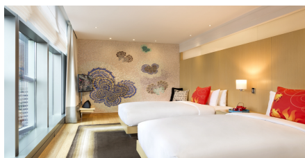
Standard Twin (320 sq ft / 32 sq m)