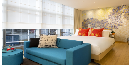
Standard King (320 sq ft / 32 sq m)